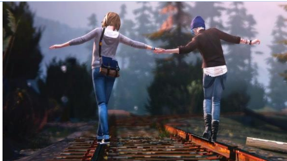
Life is strange - Train Tracks

Chloe drives Max to the entrance of Blackwell. The weather has begun to get rainy.