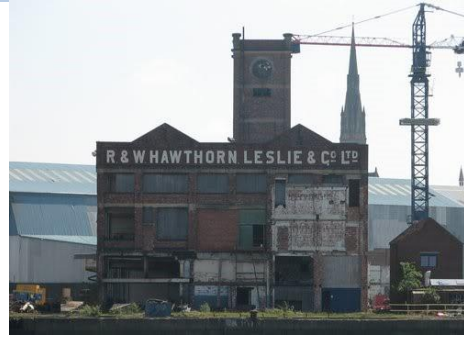
Hawthorn Leslie - Our location