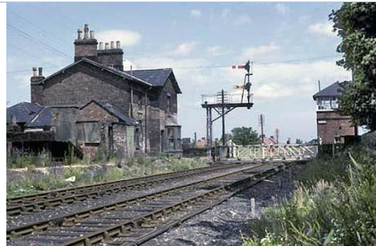
Pelaw - Abandoned metro tracks