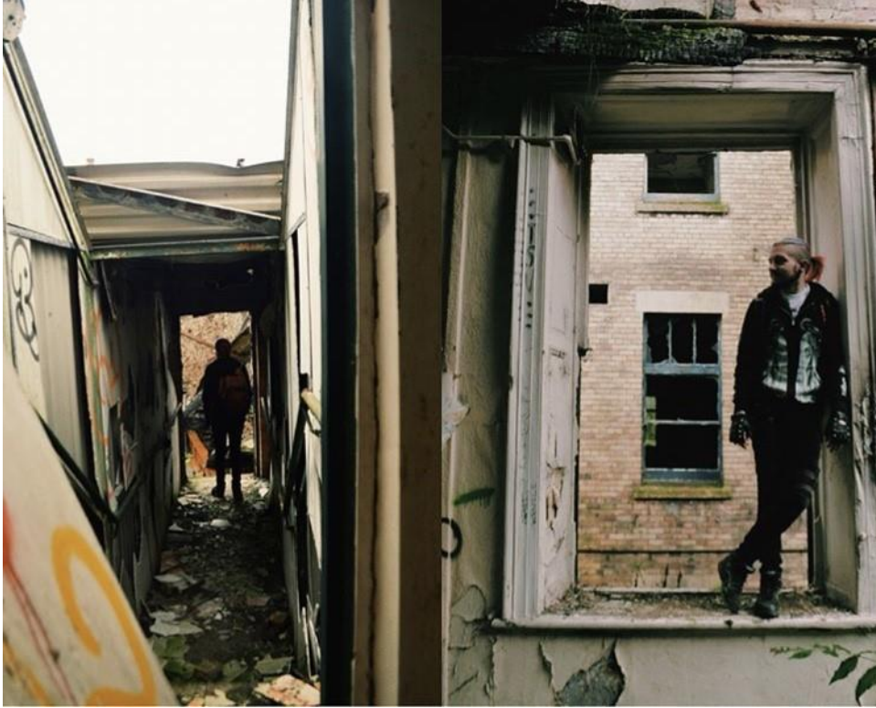
Location 2 Pelaw, Abandoned Train tracks.