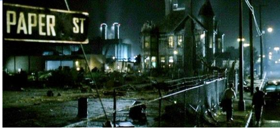
Paper street mill - Fight Club