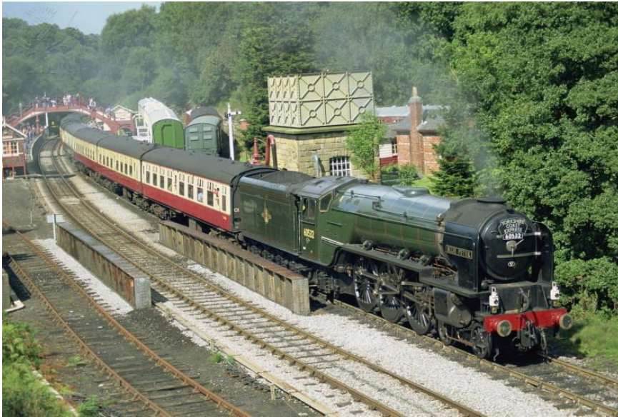
Hunter, D. & Harding, R. (2016) Train on North York Moors railway, Goathland, North Yorkshire . [Internet]. Available from http://quest.eb.com.yorks.idm.oclc.org/search/north-york-moors-railway/1/151_2575876/Train-on-North-York-Moors-Railway-Goathland-North [Accessed 11th October 2017].