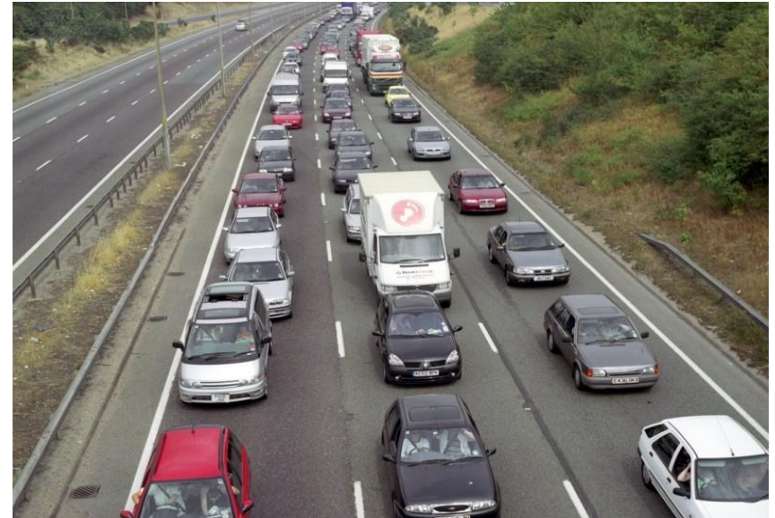
Brook, R. (2005) Traffic jam. Congestion on the A13 in Essex in 2005 . [Internet]. Available from http://quest.eb.com.yorks.idm.oclc.org/search/traffic-jam-a13/1/132_1305905/Traffic-jam [Accessed 11th October 2017].