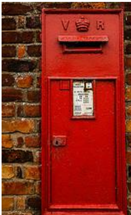
Victorian Post Box

Academic Liaison Librarians https://www.yorksj.ac.uk/ils/all/